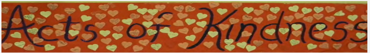
Picture from our February "Random Acts of Kindness" to others wall in the Parish Hall